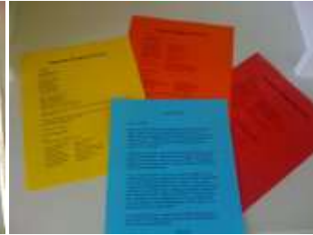
Cooking & Crafts